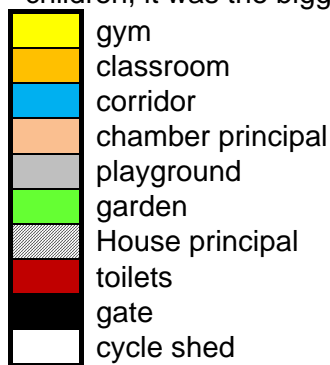
plan of the St. Radbod

On Thursday the girls had to stay longer; they had to do needle work. Discipline was very important. If you did something that was not allowed, you were punished. You had to stand in the corner of the classroom or in the corridor. Sometimes the teacher went to your parents and then they would punish you once again. There was a break at ten o'clock. We did all kinds of games like play with marbles, touch, running, hiding etc. Everyone was allowed to take part. When the teacher had his birthday, there was a party. If one of the pupils had his or her birthday, everyone congratulated him or her, but there never was a treat. The big party was at April 30 th , when the queen had her birthday. There was no school. In the towns and villages there was a real party. There was a procession, singing games etc. For children, it was the biggest party of the year.